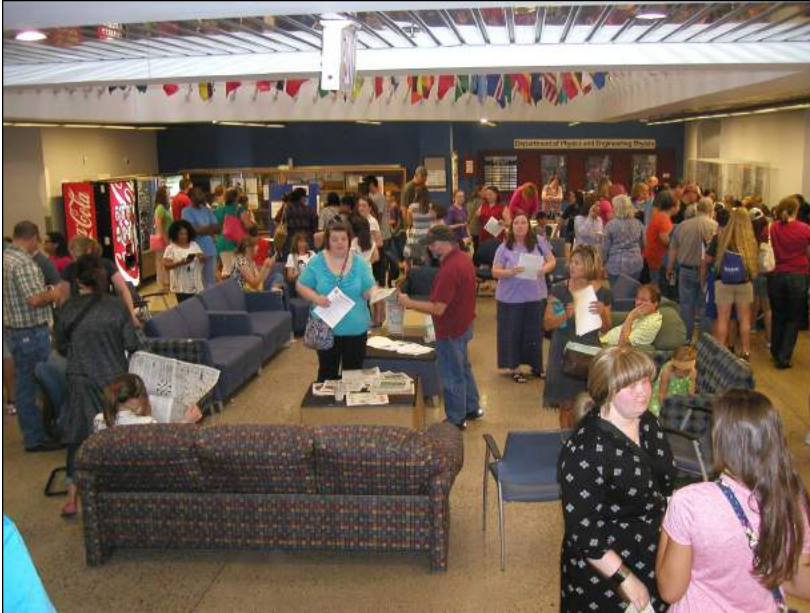
Closing at Tech Trek sees happy campers, parents glad to see their daughters, excited siblings checking out the displays. The event was in the Atrium at Keplinger Hall.