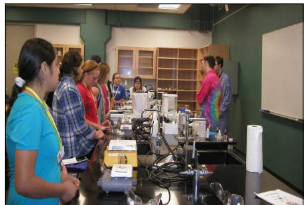
The Nanoscience Class quizzing their instructors before they begin a process to break down a gold solution into nano-particles.