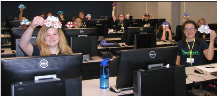
These "Trekkies" in the App Inventor Class are writing an app to find their car in the parking lot. It worked!