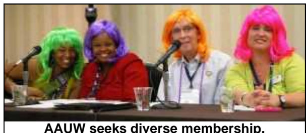
AAUW seeks diverse membership. (Photo from Membership Workshop at National Convention)