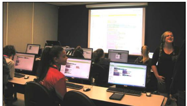
App Invention class learning the basics of writing an app for their devices.