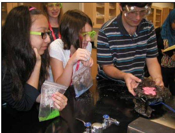
Young future scientists create and name a new substance, a 'soliquid', called Oobleck, which exhibits properties of both a solid and liquid.

Campers participated in one of four core classes each morning. They chose their class when they registered and stayed with it the full week. The classes, App Inventing, Cryptography, NanoScience and Lil Bits (robotics) were taught by teachers with STEM teaching experience.