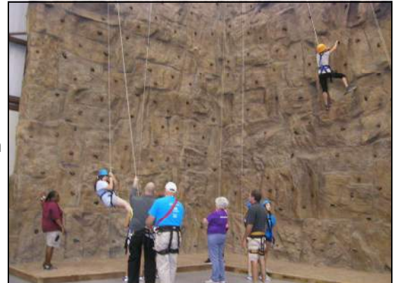
Campers are learning teamwork on the Rock Climbing Wall.

Laureate Psychiatric Hospital and the Institute of Brain Research was the destination for Tech Trekkers on