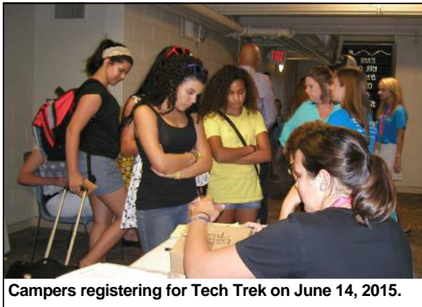
Campers registering for Tech Trek on June 14, 2015.