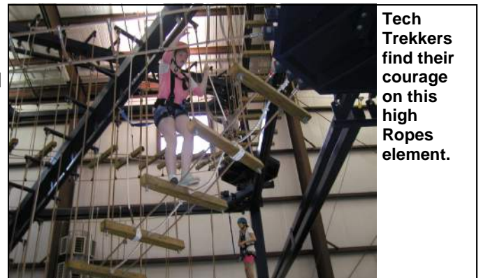
Tech Trekkers find their courage on this high Ropes element.