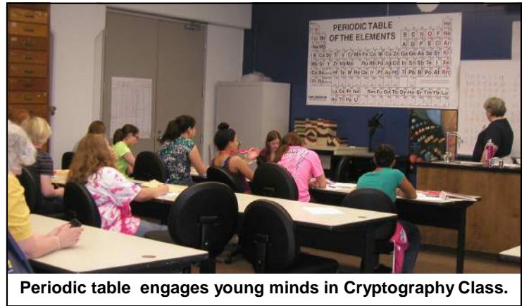
Periodic table engages young minds in Cryptography Class.

Campers participated in one of four core classes each morning. They chose their class when they registered and stayed with it the full week. The classes, App Inventing, Cryptography, NanoScience and Lil Bits (robotics) were taught by teachers with STEM teaching experience.