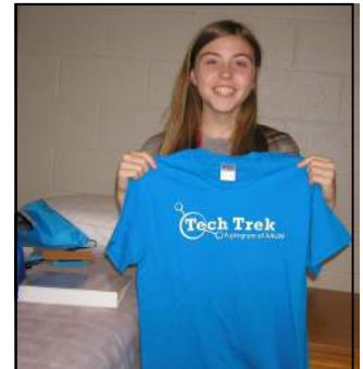
Camper shows off her new Tech Trek T-shirt.

Student Counselors accompanied the girls to their rooms. Student Counselors were college student volunteers who assisted teachers, Dorm Monitors and the Camp Director with activities, field trips, material preparation and general camper needs. Dorm Monitors were adults paired with a Student Counselor; together they were responsible for a “dorm group” of ten to twelve girls.