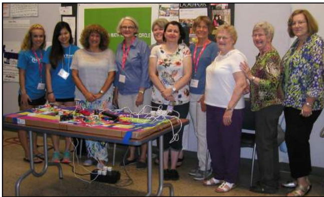
Tech Trek Staff and AAUW members at the Closing and Project Presentation.

Saturday morning after the girls had packed up, everyone went to the Closing, where the parents and girls could view the projects from each of the four Core Classes.