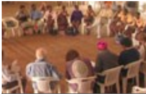
DeWolf descendants meeting with Ghanaians, African-Americans, and others at the Town Hall, Cape Coast, Ghana.

Traces of the Trade is a feature documentary of the descendants of the largest slave-trading family, the DeWolf family, in U.S. history. The film debuted at the 2008 Sundance Film Festival in Park City, Utah.