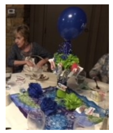
Centerpiece fashioned by Tulsa branch for the banquet.