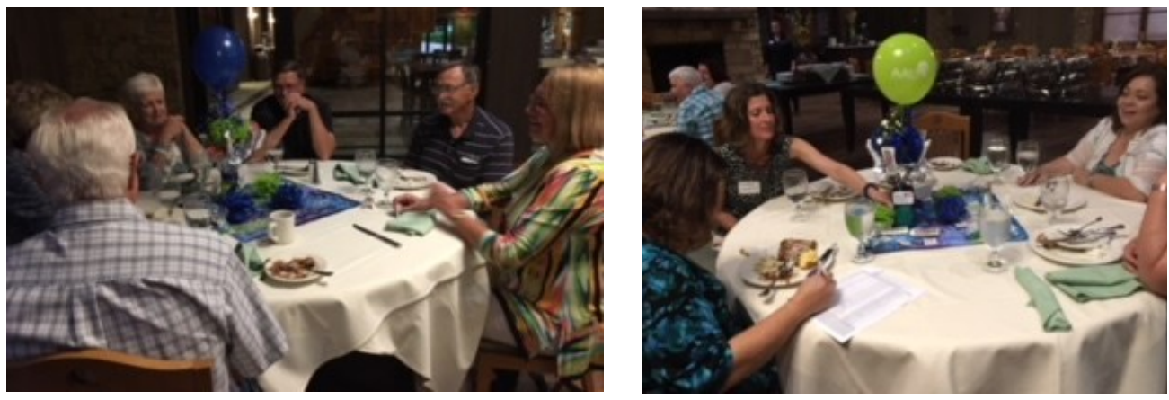
Members and spouses at the Saturday evening banquet