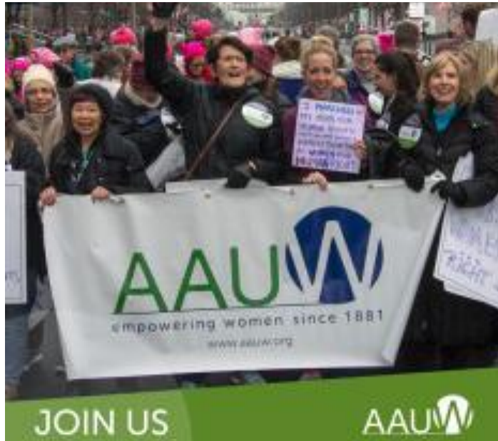
AAUW members in the Women's March.