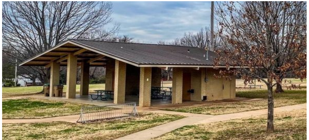
Zink Park Shelter

We are excited to be able to meet in person. Since we don't meet through the summer, our next meeting will be in September.