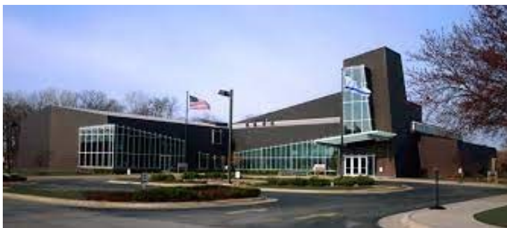
Sherwin Miller Museum of Jewish Art on the Zarrow Campus.

The Sherwin Miller Museum of Jewish Art is located on the Zarrow Campus at 2021 E. 71st St. in Tulsa and is open to the public Monday through Friday, 10 a.m. to 5 p.m., Saturday Noon to 5 pm and on Sunday, 1 to 5 pm.