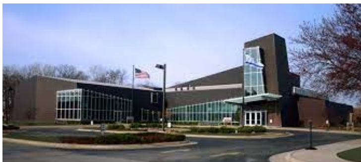
Sherwin Miller Museum of Jewish Art on the Zarrow Campus.

The Sherwin Miller Museum of Jewish Art is located on the Zarrow Campus at 2021 E. 71st St. in Tulsa and is open to the public Monday through Friday, 10:00 a.m. to 5:00 p.m., Saturday Noon to 5 pm and on Sunday, 1:00 to 5:00 pm.