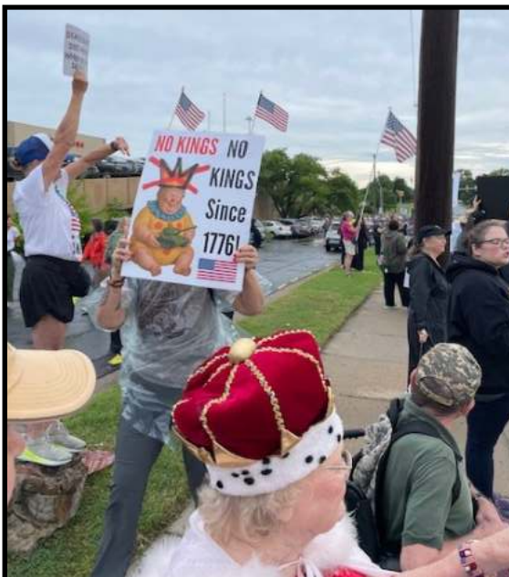
Some of the crowd at the 'No Kings' Rally at 41st & Yale, June 13, 2025.